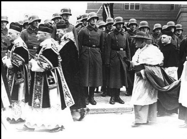
NAZIS AND PRIESTS IN CEREMONY

In summary the facts are these, Hitler was brought up a Catholic and he clearly believed in Jesus and a God. It is clear he was not an atheist from the speeches he had given. His view was that the Jews betrayed Jesus and that he would be God's avenger. Obviously an atheist would not act like this, for he would not care if the Jews were or were not responsible for the death of Christ. It would be meaningless to an atheist. It is clear the Christian religion did play a part in shaping Hitler's hatred of the Jews and the church did little or nothing to stop Hitler.