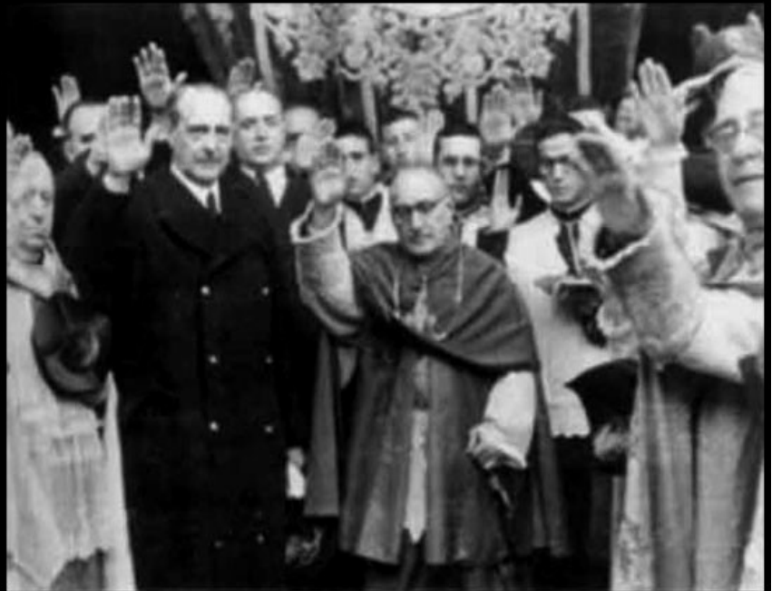
CLERGY SALUTING HITLER

After the war Germany would be able to fully implement the "final solution" to the "Christian problem" so that the Nazi party would be in complete control. Hitler thought that all Christians would betray their God when they were forced to choose between the swastika and the Cross: 'Do you really believe the masses will be Christian again? Nonsense! Never again. That tale is finished.