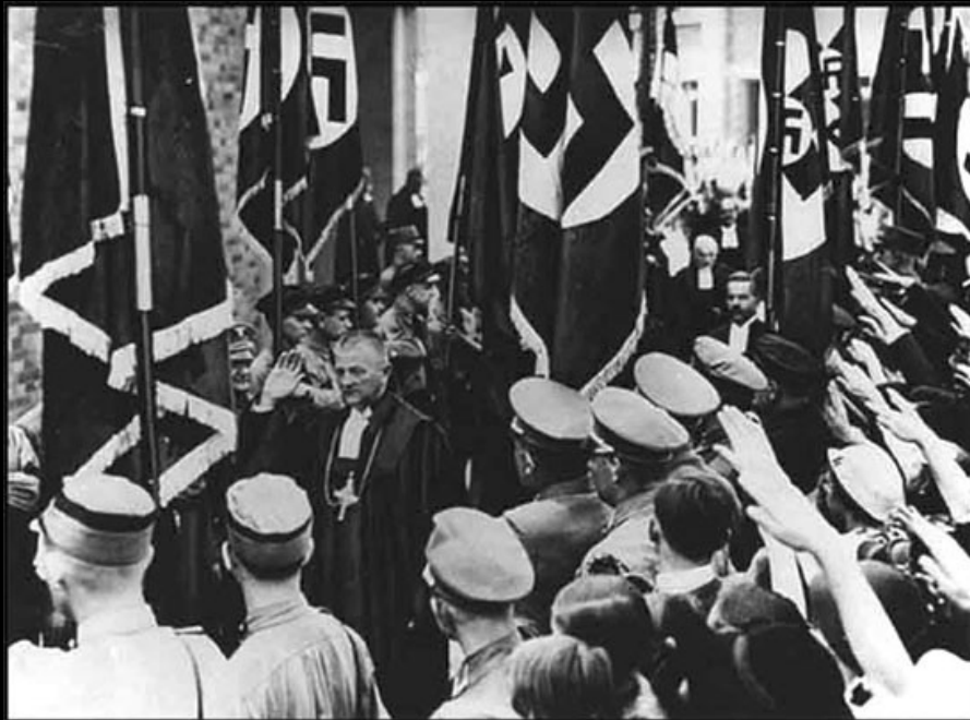
Catholic Bishop Ludwig Müller saluting the Nazis

The Jews he viewed as enemies of all civilization and as materialistic, unspiritual beings. In his book the Mein Kampf : Hitler described his supposedly divine mandate for his anti-Semitism: "Hence today I believe that I am acting in accordance with the will of the Almighty Creator: by defending myself against the Jew, I am fighting for the work of God".