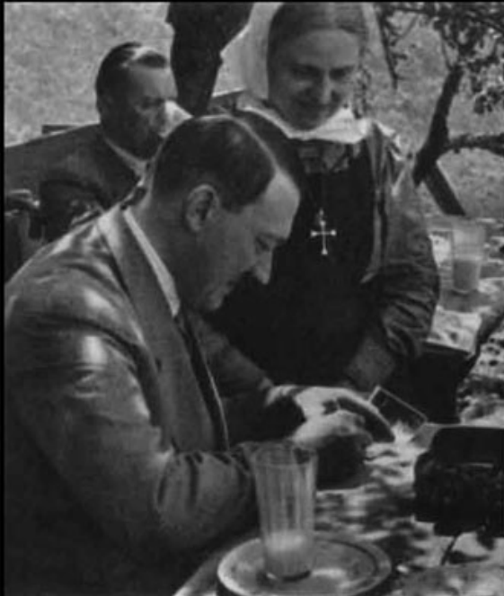
HITLER PRAYING WITH NUN

Another reason Hitler later opposed Christianity was because Hitler saw Christianity and Science as diametrically opposed to each other. He concluded science would win, and the Christian church would eventually in due time be destroyed. Hitler even believed science was the creation of the German race. Hitler was trying to use science — especially a twisted form of Darwinism that the Aryan race was created by God to rule the world.