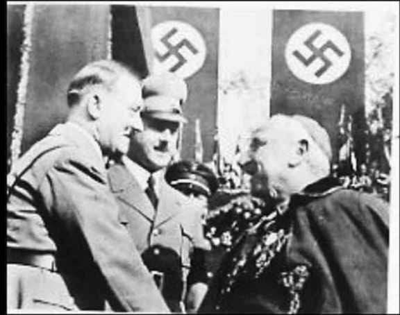
HITLER & BISHOP NUNCIO ORSENIGO

In summary the facts are these, Hitler was brought up a Catholic and he clearly believed in Jesus and a God. It is clear he was not an atheist from the speeches he had given. His view was that the Jews betrayed Jesus and that he would be God's avenger. Obviously an atheist would not act like this, for he would not care if the Jews were or were not responsible for the death of Christ. It would be meaningless to an atheist. It is clear the Christian religion did play a part in shaping Hitler's hatred of the Jews and the church did little or nothing to stop Hitler.