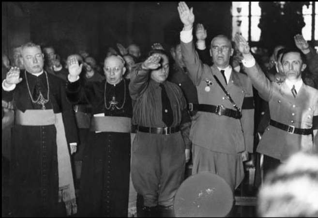
PRIESTS SALUTING HITLER

No one will listen to it again. But we can hasten matters. The parsons will dig their own graves. They will betray their God to us. They will betray anything for the sake of their miserable jobs and incomes.