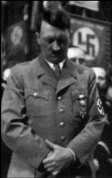
HITLER IN PRAYER

Christians constituted a wellspring of support for Hitler. Steve Allen notes that Nazi Germany in the 1930s "was the most church-affiliated nation in Europe. The German people were almost entirely Catholic and Lutheran. Despite such factors they launched the Holocaust and World War II." Charles Kimball likewise says the Holocaust "would not have happened without the active participation of, sympathetic support of, and relative indifference exhibited by large numbers of Christians."