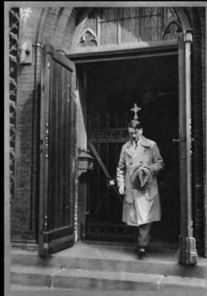
HITLER ATTENDING CHURCH

Also in pre-World War II Germany, corporal punishment was used in the schools and school children were required to start their days with prayer. Today's advocates of spanking and school prayer should consider that these practices, although supported by religion, proved ineffective in promoting high ethical standards and good behavior among the German youth.