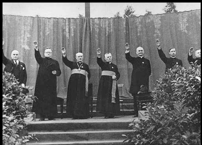
PRIESTS SALUTING HITLER